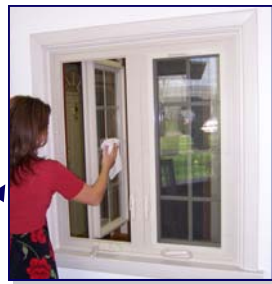
Clean easily and conveniently from the interior of your home