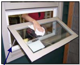
Open sash completely

When closing and locking your Encore casement or awning window, ensure that the sash is seated completely on the frame before locking.